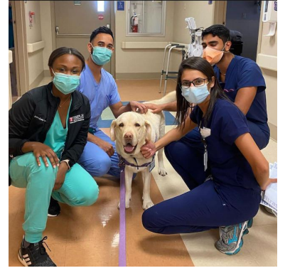
The staff at Westside Regional loves our doggies too!